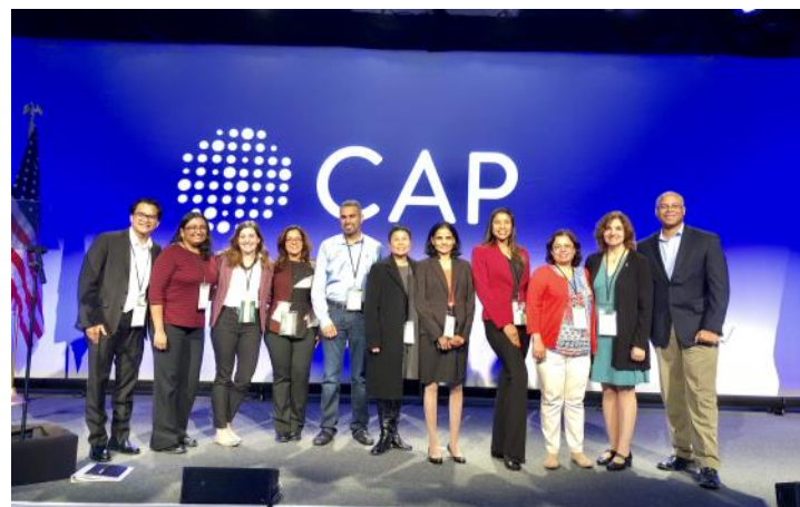
Illinois Delegation to the CAP House of Delegates

Rightfully Illinois was well represented at the CAP House of Delegates held during the Fall Meeting in October, Chicago.